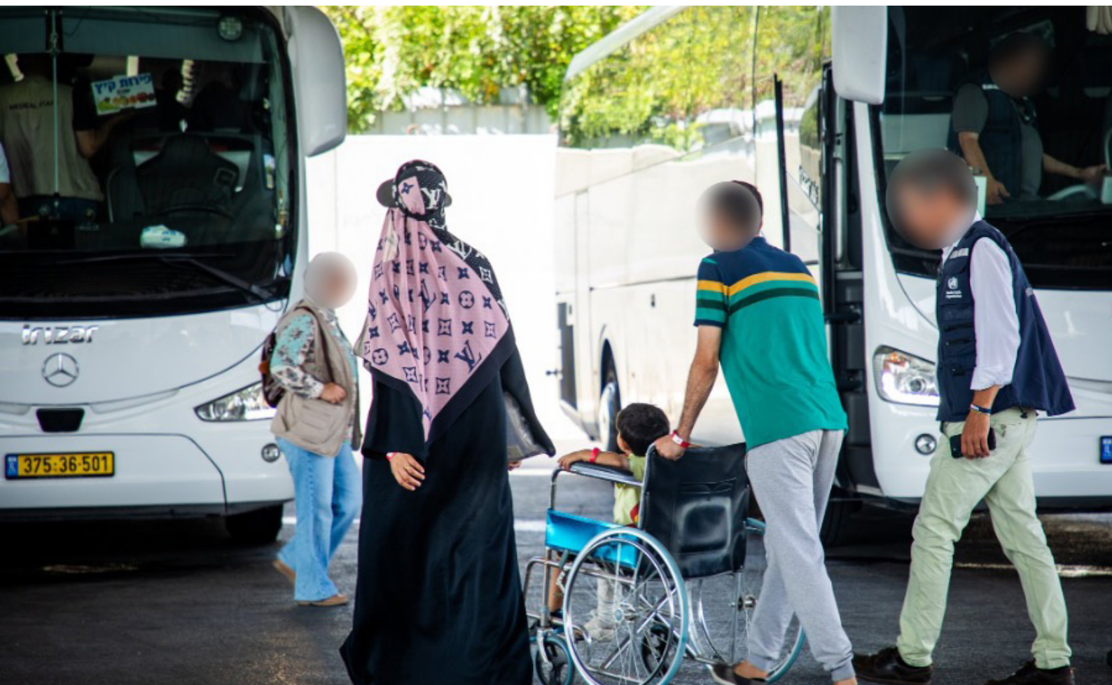
160 children left Gaza for medical treatment with caregivers, through Kerem Shalom Crossing to the Allenby Bridge Crossing for treatment in Jordan and to the EU.