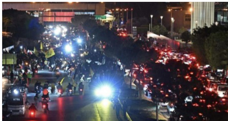
Pro Hezbollah rally in Beirut protesting disarmament