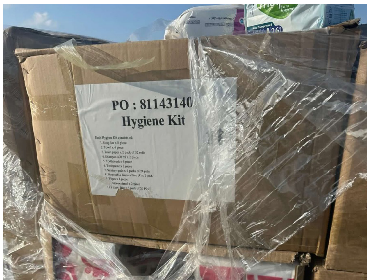
Nearly 2,500 tons of hygiene kits and products have entered Gaza