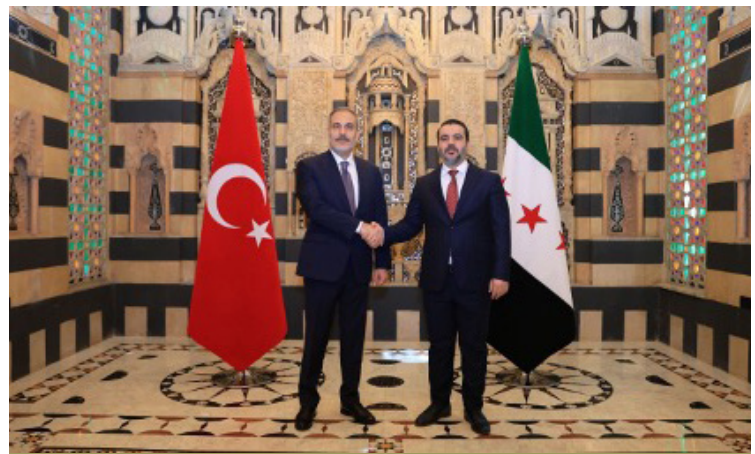
Turkish foreign minister Hakan Fidan meeting his Syrian counterpart in Damascus