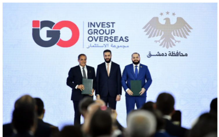
President al-Sharaa signing new MOUs with a number of international companies