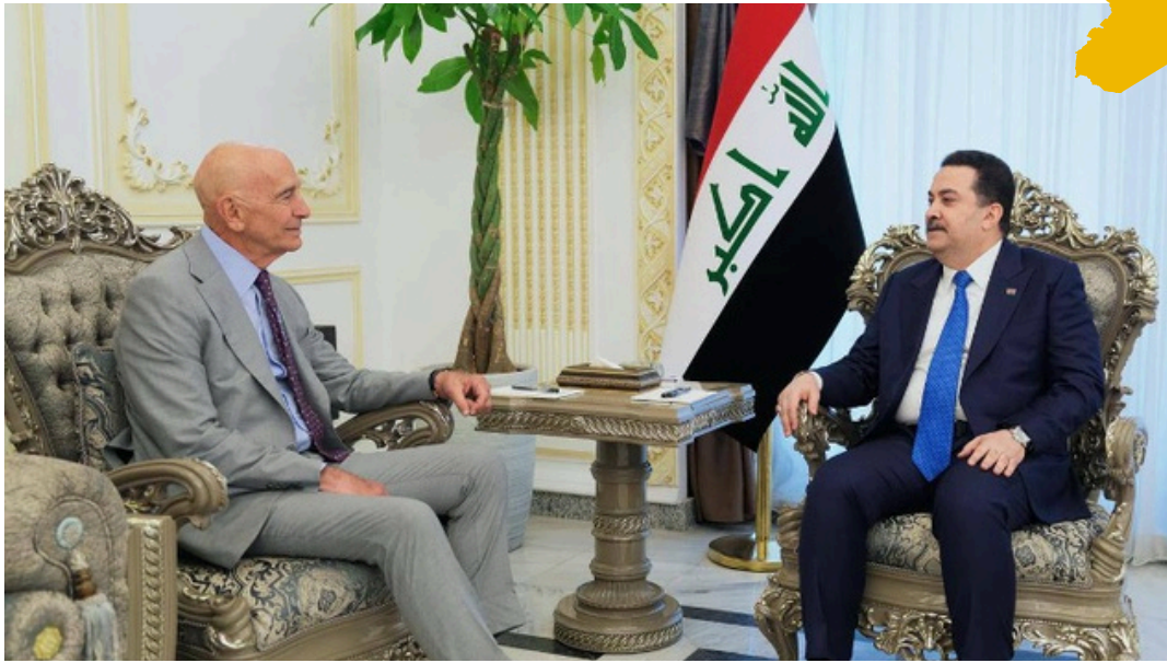
Envoy Tom Barrack meets Iraqi Prime Minister Mohammed Shia al-Sudani