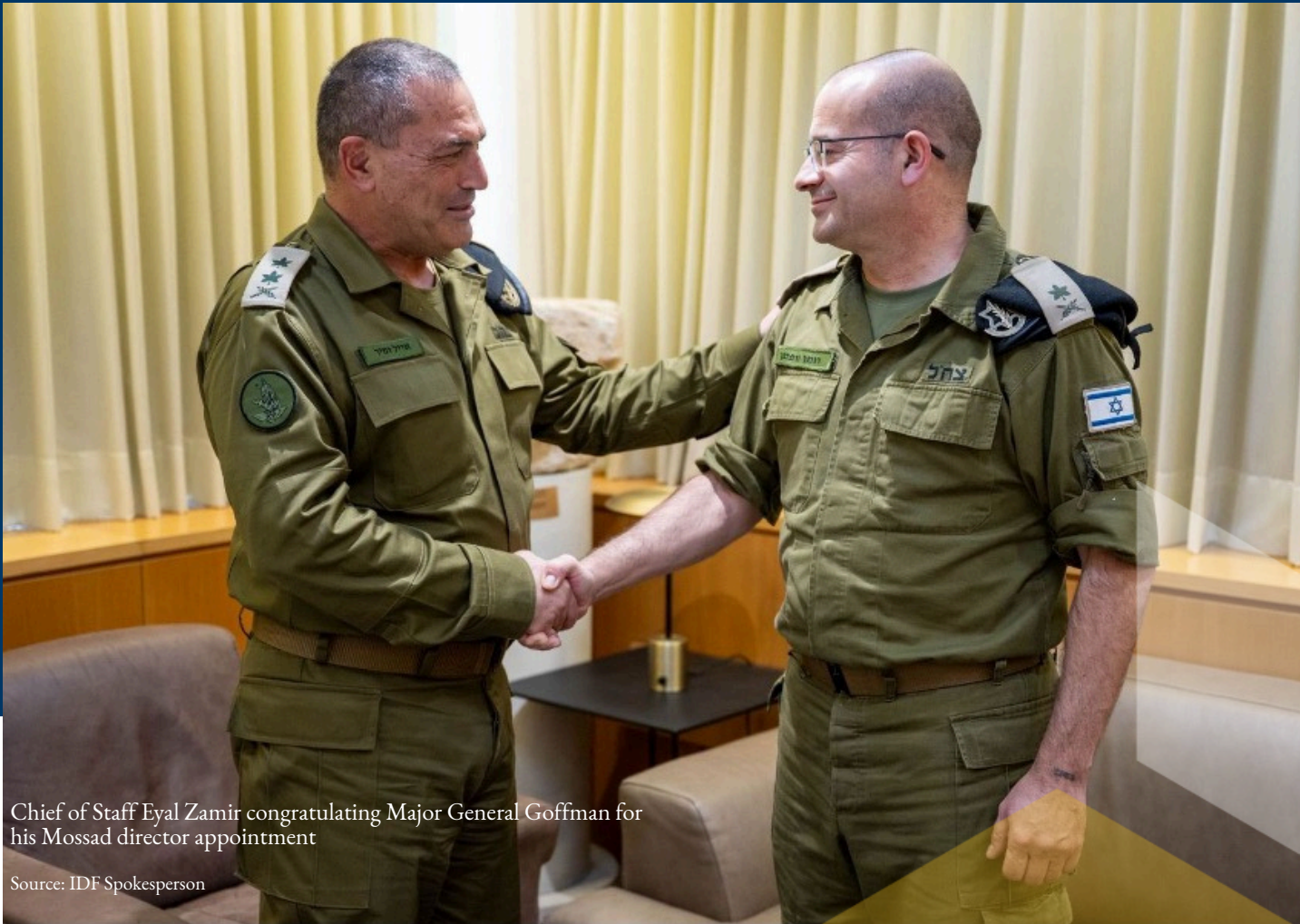
Chief of Staff Eyal Zamir congratulating Major General Goffman for his Mossad director appointment